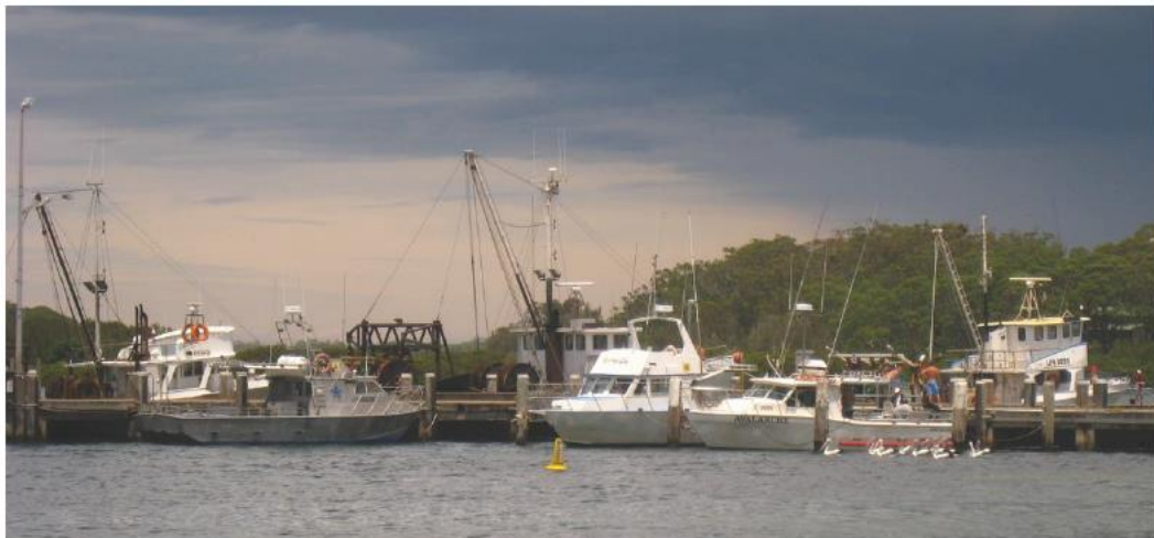
Australia has many lovely harbours and river estuaries not part of the popular image

There were more but I am bored now. Must be a full-time job keeping up to date with all of these conspiracies. . . . even in Australia. . . David Shield